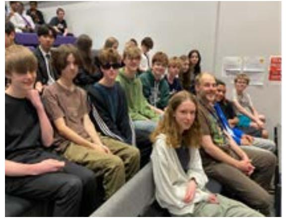
The students enjoyed their evening of live music where they were introduced to ways of analysing music through live listening.

Last week, a group of students visited Leeds Conservatoire for a Music Degree Experience Day.